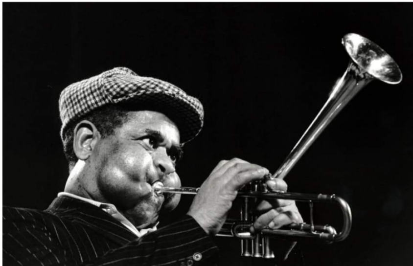
454-B Pine Street

Dizzy Gillespie, born in Cheraw, South Carolina....died January 6, 1993, Englewood, New Jersey. Jazz trumpeter, composer, and bandleader who was one of the seminal figures of the bebop movement.